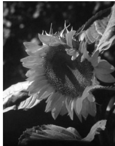
I changed the color image to black & white to better understand the values.