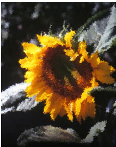
I decided to continue manipulating the image in Photoshop by working in filters.