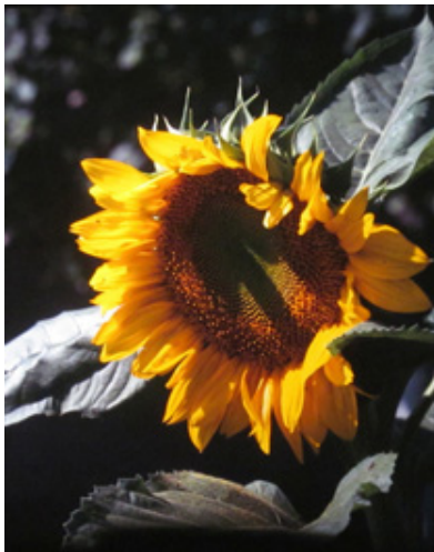
This is one of my personal photos taken in the garden at our old house.

This painting was created on a 300lb hot press paper by Fabriano. The color selection is transparent and staining. I decided not to use a masking fluid for the lights, but rather lift the light if it became necessary. This would permit some softness in the shapes of light.