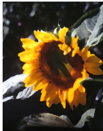
Both of these images show painterly effects and at the same time, the image has been simplified.